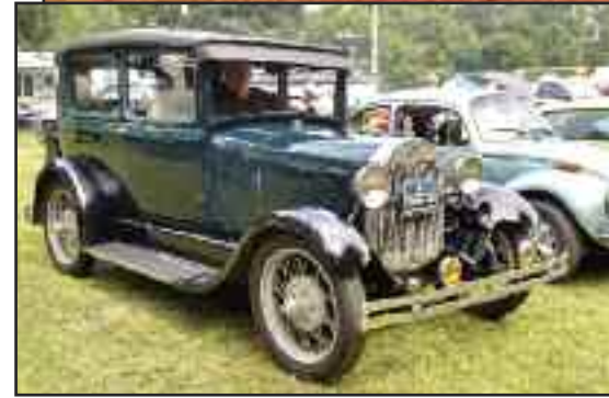
A "Governor's Staff" Model A Ford. George Wallace campaign contributors were frequently given these special plates.

This hit and miss engine consumes only a drop of fuel every few seconds.