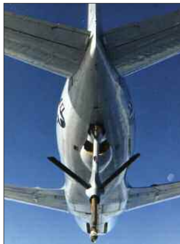
Getting ready to "hit" the tanker. View from the AWACS cockpit during air refueling.

While nobody will disagree that excellent training in any career field is paramount, many still unfortunately oppose standardization; mostly because of its potential punitive aspects. At the same time, however, success of any operation cannot be relegated to a training program that has no way of verifying its own validity. Regardless of the profession, development of a program that embraces training and standardization/ evaluation is essential for success.