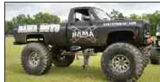
Bama Boys monster truck.