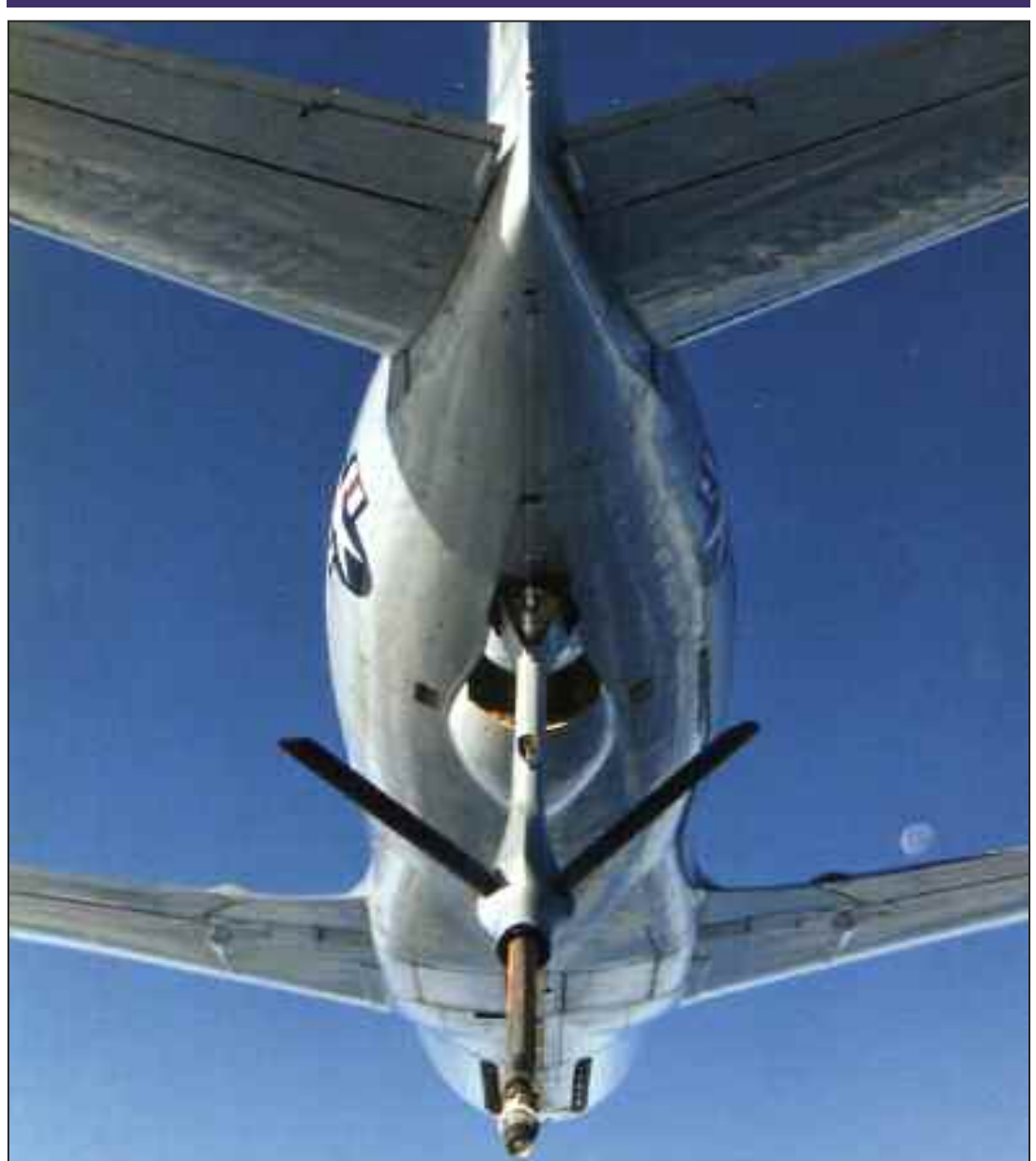
Getting ready to "hit" the tanker. View from the AWACS cockpit during air refueling.

Because of the Germanwings Flight 9525 crash where the copilot Andreas Lubitz intentionally crashed his Airbus 320-200 into the French Alps killing all 150 people onboard, my previous Robservation focused on the aviation industry's need to develop and maintain robust selection and training programs. In addition to these two aspects, however, any organization that wants to succeed must also implement training's evil twin, Standardization/ Evaluation . I say evil with tongue in cheek, but standardization goes beyond training in that it encompasses aspects of analysis, enforcement and if necessary, punishment; punishment in that if you don't make the standard, you're finished.