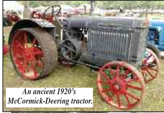
An ancient 1920's McCormick-Deering tractor.

Visit next year. Each year brings in something new. Don't miss it!