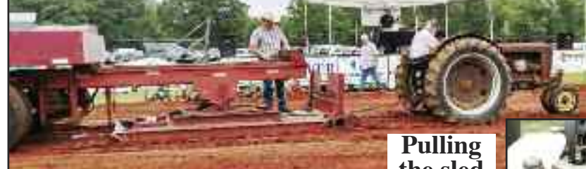
Pulling the sled.

This hit and miss engine consumes only a drop of fuel every few seconds.