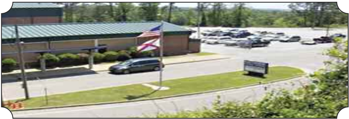
Southside Middle School 901 East B Payne Sr Dr., Tallassee, AL 36078 334-283-2151