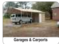
Garages & Carports