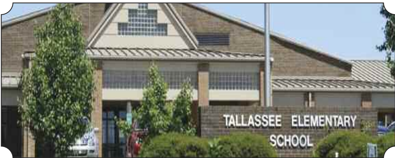
850 Friendship Road, Tallassee, AL 36078, 334-283-5001