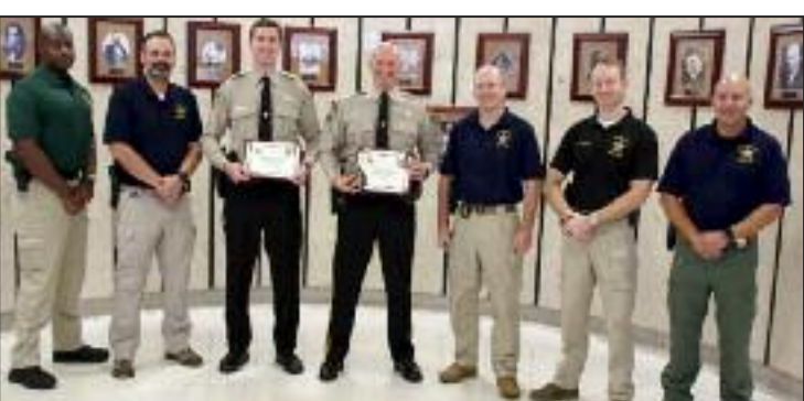
SWAT Pinning Ceremony