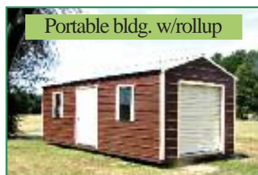
Portable bldg. w/rollup