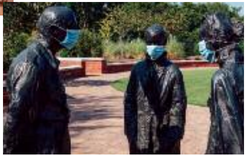
George Segal, Chance Meeting , 1986.

Advance registration is not required to visit the Museum; however, in order to allow for ample social distancing, the number of visitors at any one time will be limited. All Museum visitors over the age of five are required to wear a mask or face covering during their visit.