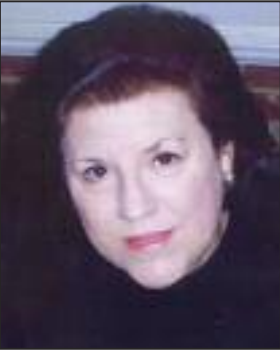
Judge Peggy Givhan